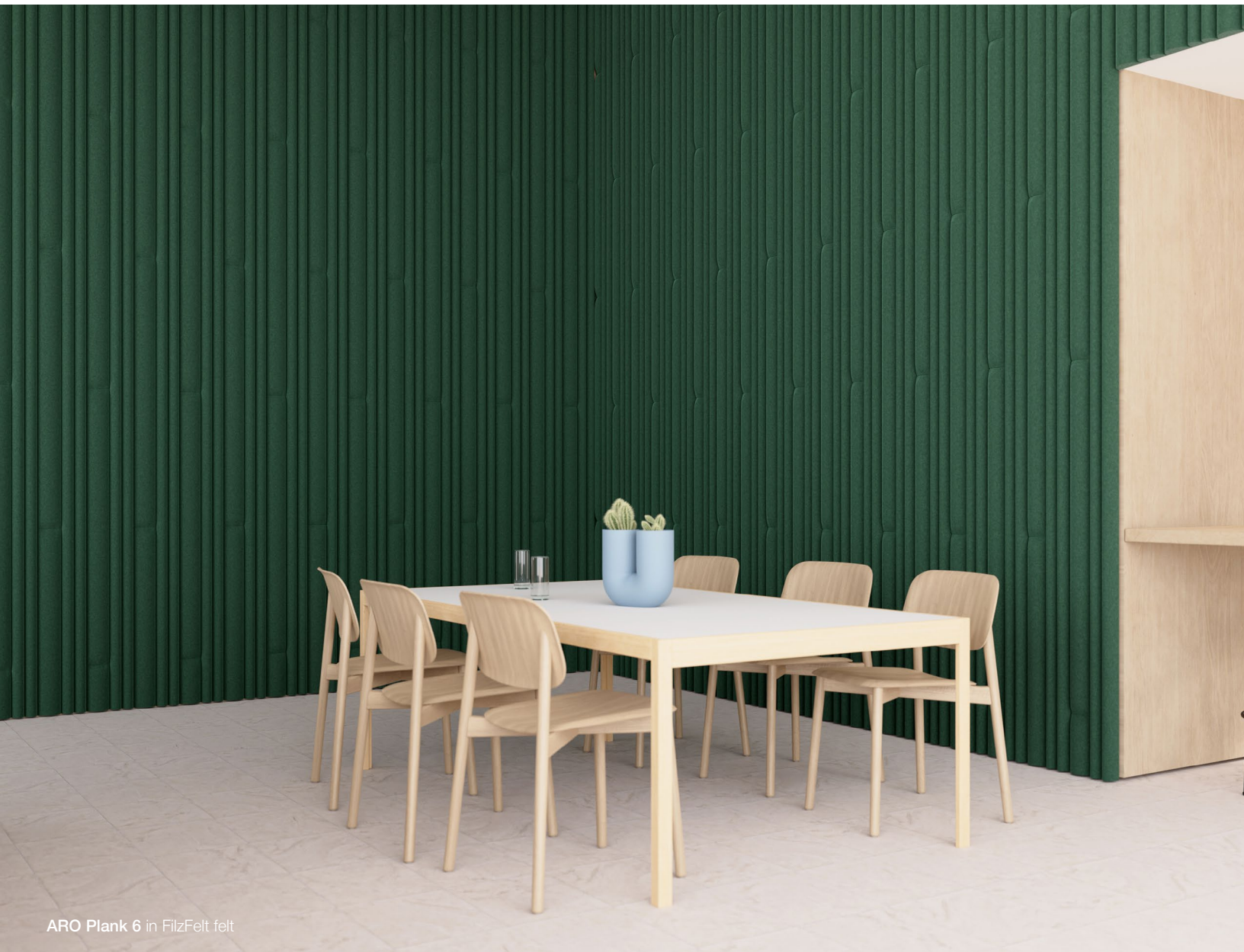
ARO Plank 6 in FilzFelt felt