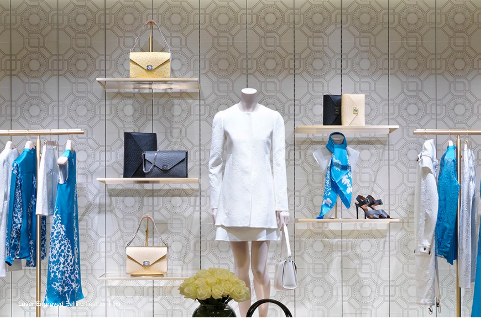
Laser Engraved Beveled Leather Tiles