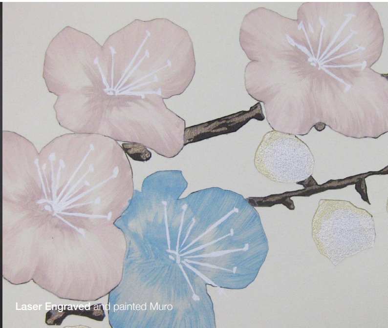
Laser Engraved and painted Muro